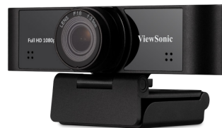
HD Webcam VB-CAM-001

For more information contact your ViewSonic representative today.