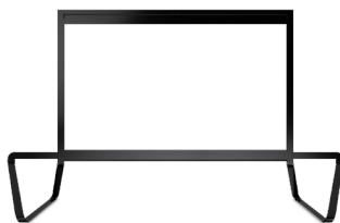
135" Mobile Display Stand LD-STND-001 165" Mobile Display Stand LD-STND-002