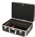
Docking Station Case LA-481