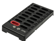
Docking Station Tray LA-480