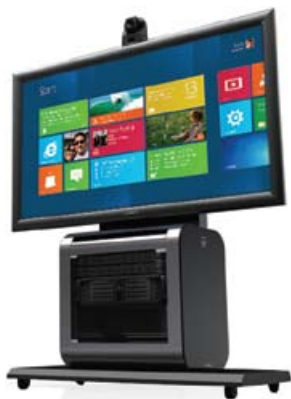
CommBox optional AV Rack Stand