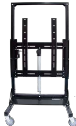
CommBox optional Motorised Stand