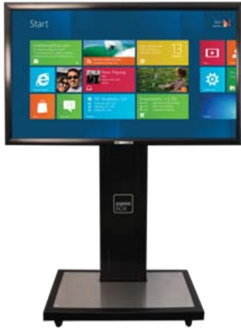
CommBox optional Moveable Stand

As the original manufacturer, Commbox guarantees the latest screen technology and the most affordable pricing.