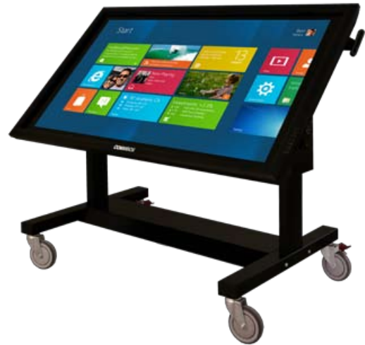
CommBox optional Tilt/Table Stand