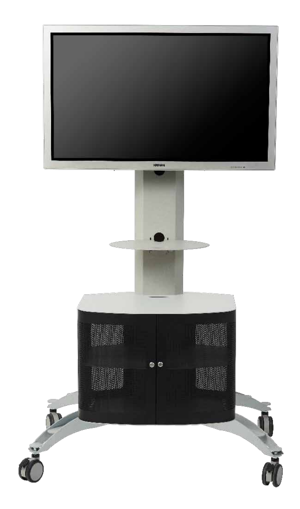
Screen not included