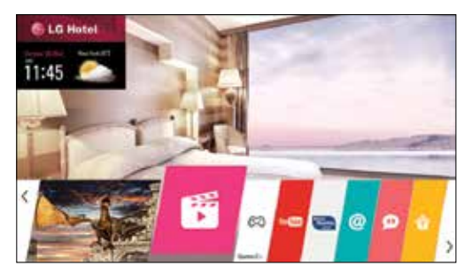
Customised UI & Service